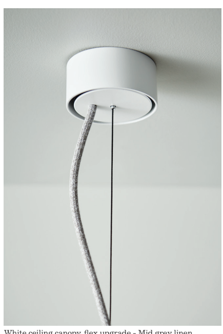
White ceiling canopy, flex upgrade - Mid grey linen