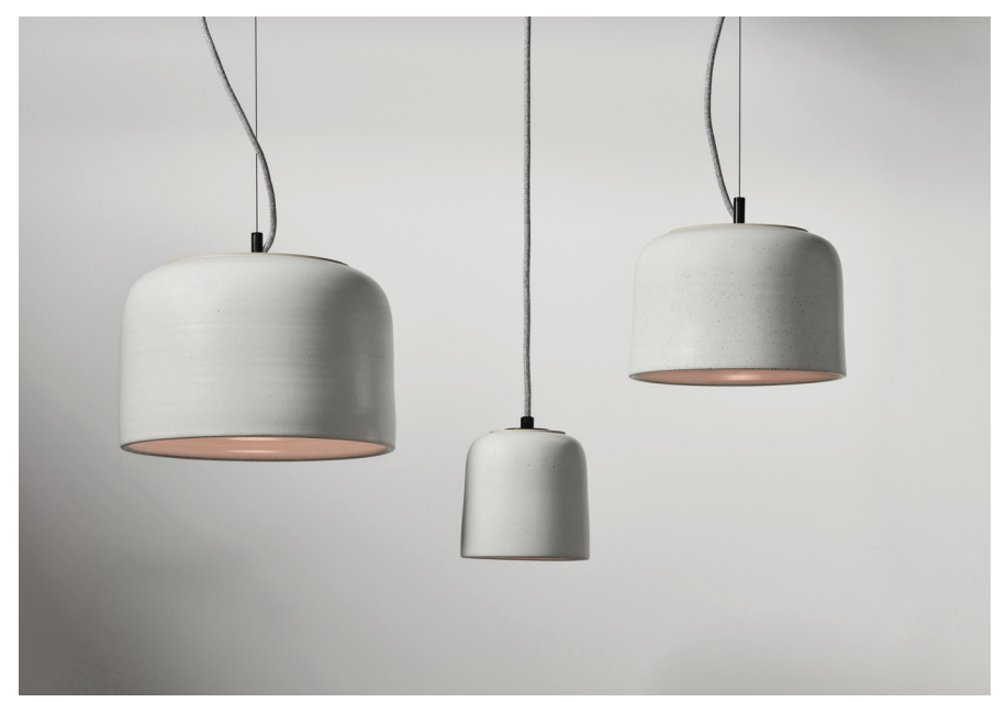
Potter Light, large, small, medium - Speckled white satin