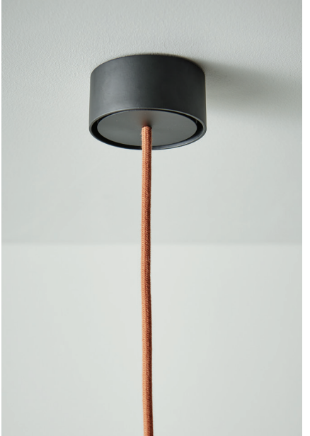
Black ceiling canopy, flex upgrade – Deer cotton

The elemental geometric form of the Potter Light range is both simple and architectural. Wheel thrown by master potter, Michael Skewes, the fittings are made using a selection of high quality, Australian made stoneware and earthenware clays. Each of the fittings is imbued with the subtle differences in finish and form inherent in an authentically handcrafted object. The electrical componentry has been designed to complement the handmade nature of the ceramics.