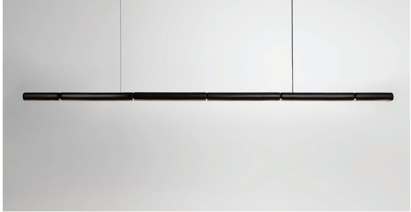
Potter DS, pendant, 2250 – DS Charcoal