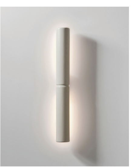
Potter DS, wall mount – DS White

Designed by Bruce Rowe for Anchor, the ceramic Potter DS wall and pendant lights are the outcome of a creative and technical collaboration with our long-term lighting partner, Rakumba Lighting and master potter, Michael Skewes. Designed and made using a hybrid process of traditional ceramic techniques and contemporary digital tools, the DS is simple and refined, focusing on the essential beauty of the ceramic form to direct and reflect light. The external simplicity of the handmade ceramic form houses integrated aluminium and acrylic extrusions and a resolved LED lighting solution.