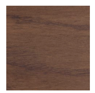
Ash Grey Oak