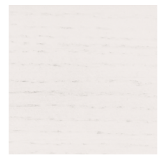
White Stained Oak