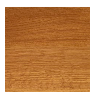
Orange 19 Oak Stain