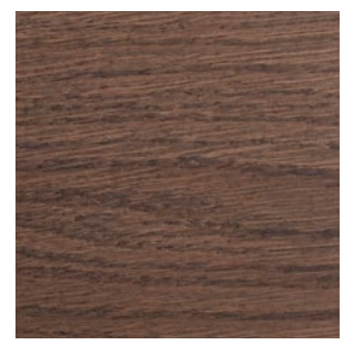
Walnut Stained Oak