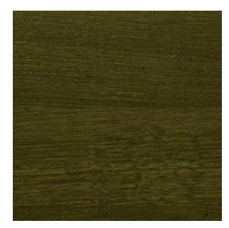
Green 21 Oak Stain